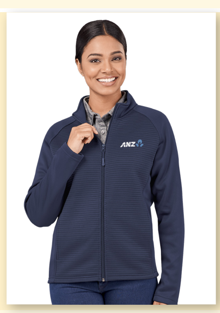
PRODUCT SLAZ-11427 CODE