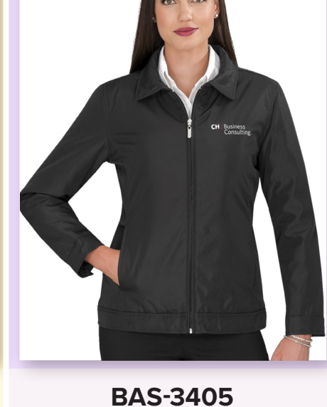
MENS & LADIES