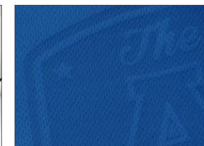
LASER ETCHING ON APPAREL