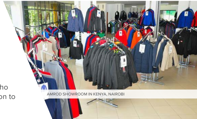
AMROD SHOWROOM IN KENYA, NAIROBI