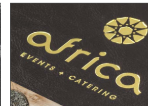
HOT FOIL STAMPING