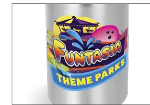
DIGITAL PRINTING ON DRINKWARE