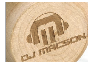
CO 2 LASER ENGRAVING