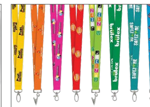
SUBLIMATION PRINTING ON LANYARDS