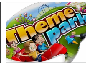
DIRECT TO PRODUCT PRINTING