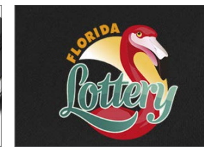
DIGITAL TRANSFER PRINTING ON APPAREL & CAPS