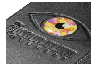
DOMED & DEBOSS COMBINATION BRANDING