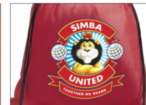
DIGITAL PRINTING ON BAGS