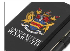
DIGITAL PRINTING ON NOTEBOOKS