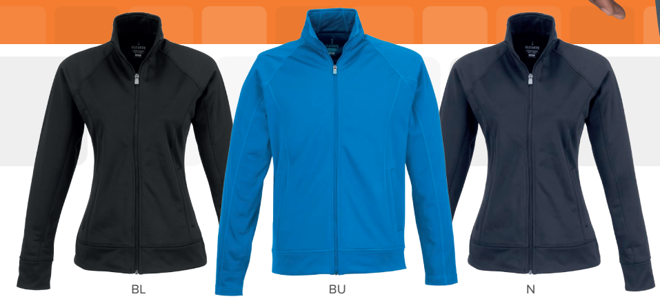
BL BU N

is 100% polyester jersey knit, with a brushed back detail and mesh pocket bags. Sporting four great colour options, Okapi's versatility makes it a great choice for university and team jackets or everyday wear.