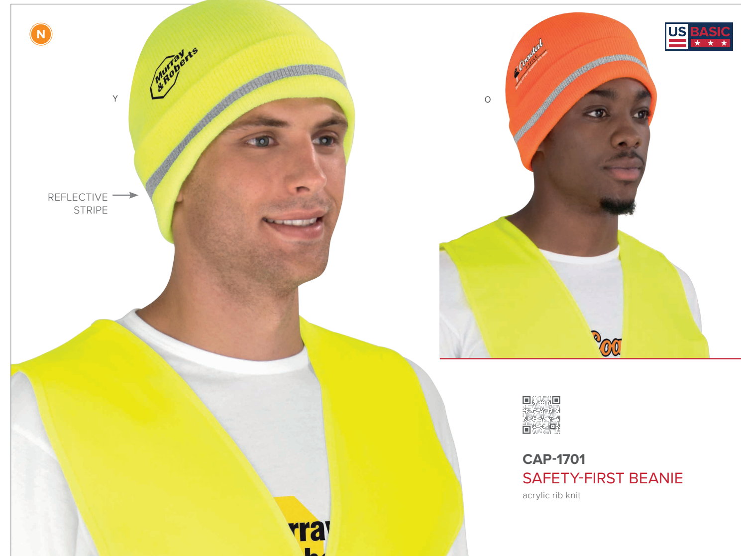
CAP-1701 SAFETY-FIRST BEANIE acrylic rib knit

LOOK OUT FOR OUR RANGE OF COMPLEMENTARY GARY PLAYER COLLECTION BAGS & GOLF DAY ACCESSORIES.