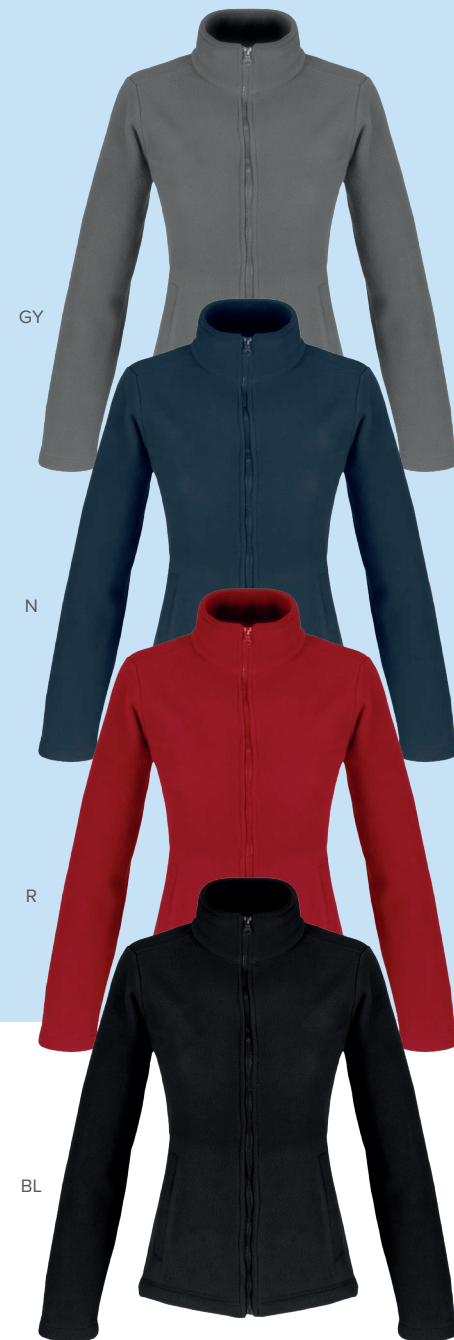
BAS-8001 LADIES YUKON MICRO FLEECE JACKET S - 4XL • 240 g/m 2 • 100% polyester micro fleece