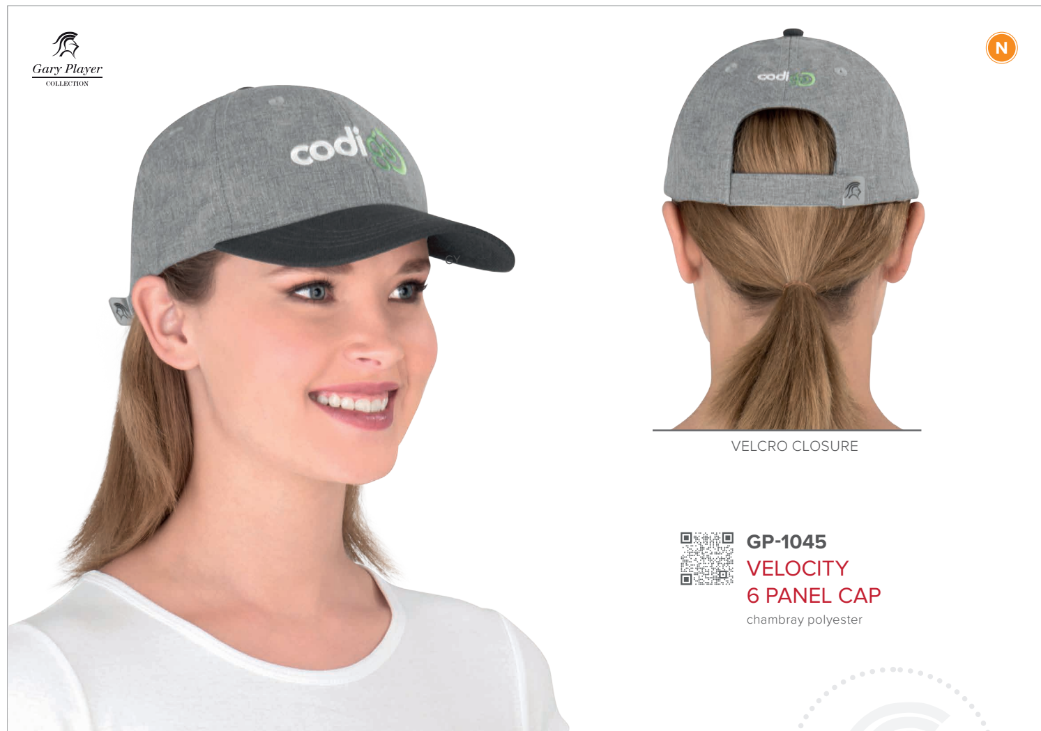
GP-1045 VELOCITY 6 PANEL CAP chambray polyester