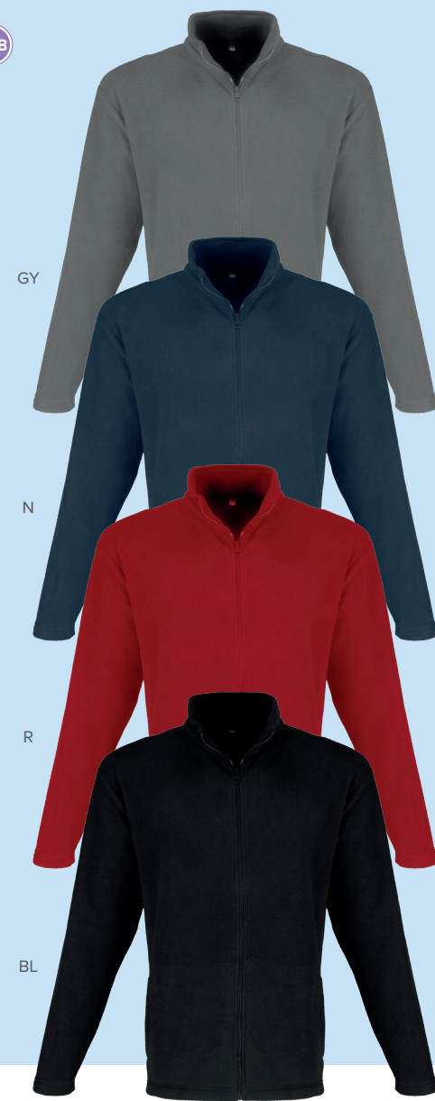
BAS-8000 MENS YUKON MICRO FLEECE JACKET S - 5XL • 240 g/m 2 • 100% polyester micro fleece